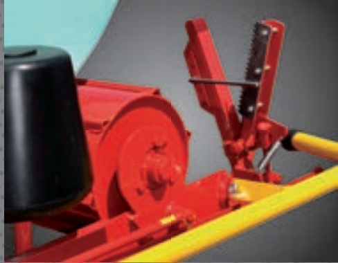
Automatic cutting of the film at the moment of tilting.