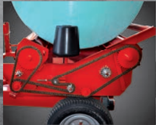
T-railed rollers with 4 speeds.