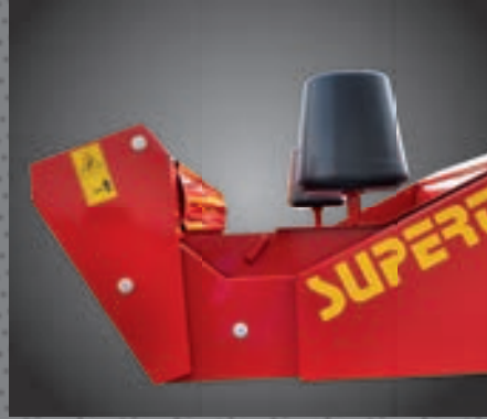
The tilting roller permits wrapping of bales with diameter between 90 and 160 cm.